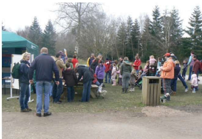
Families queue to make their bookings for events at Alice Holt Forest

At Alice Holt Forest, activities included games, minibeast hunting, bushcraft skills, den building, special sessions for under fives and family orienteering. Cycle hire was free for children. New cyclists got started on the new beginners' cycle track and the more